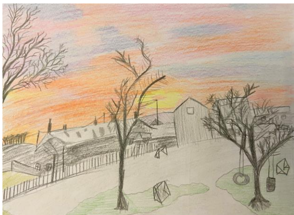
Great colours, Jacob!

We are thrilled that our pupils have taken to remote learning again so well, and we are so impressed with some of the work they've submitted that we had to share some examples with you.