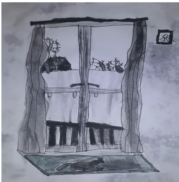
Super detail here, William!