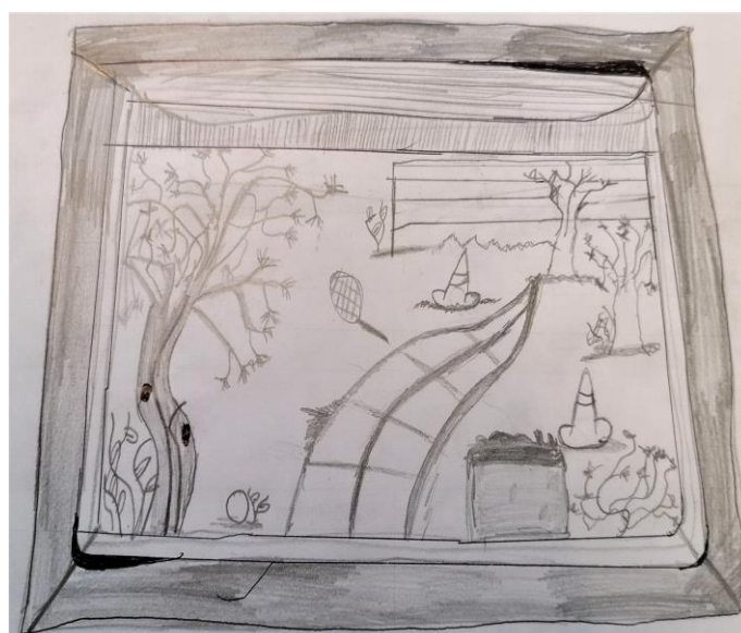
Fantastic concentration, Zoe!