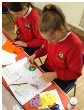
Concentration and creativity in Y8 Textiles.