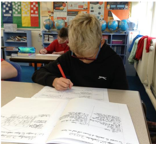
Some impressive work in Y7 English exploring layers of inference and deduction!

Just a sample of some great snapshots taken this week of our pupils' positive behaviour for learning attitudes!