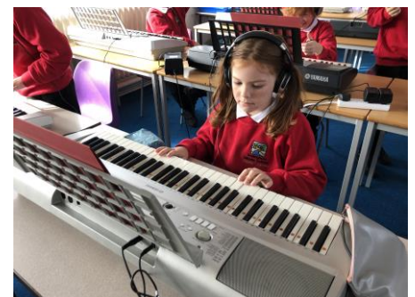
Developing musical talents in Y6 keyboarding sessions.