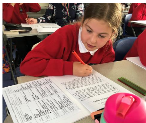
Demonstrating creative flair in English.